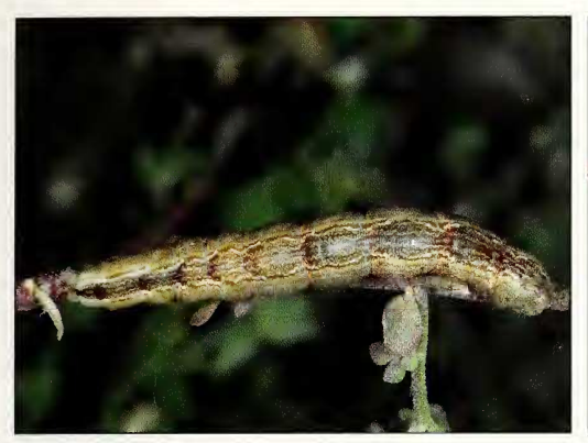
instar larva of Rhynchina canariensis (dorsal view).